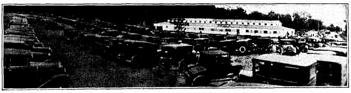
CARS PARKED AROUND THE TABERNACLE