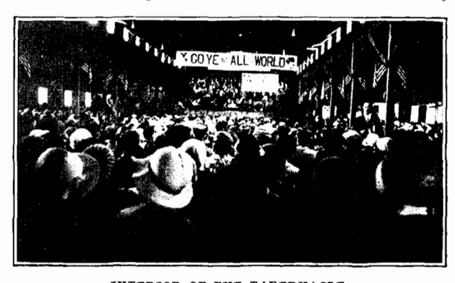
INTERIOR OF THE TABERNACLE The large tabernacle seats 1500 people. The platform will accommodate a large choir and orchestra. Screened windows provide plenty of ventilation. A large prayer room is located in the rear of the tabernacle where hungry hearts can seek the Lord.

The Eighth Annual Camp and Bible Conference will be held this year from June 17 to July 4—18 days. Last year over 5,000 people gathered from all parts of the United States, and from present indications the 1934 Camp